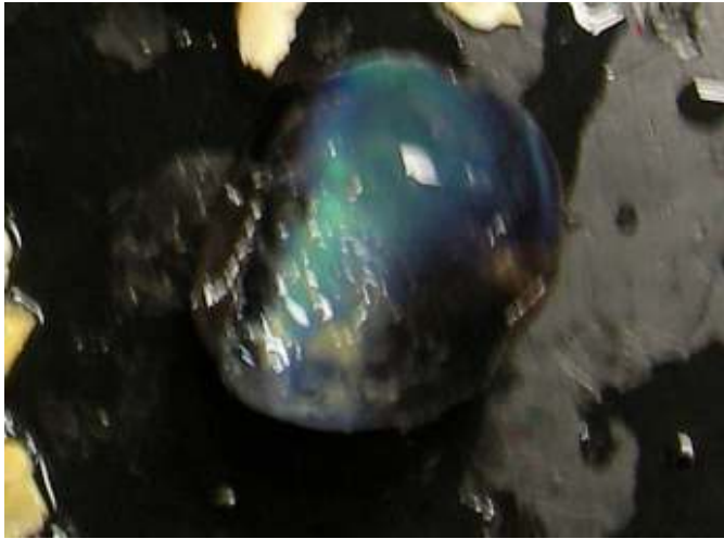
Vitreous humor sac