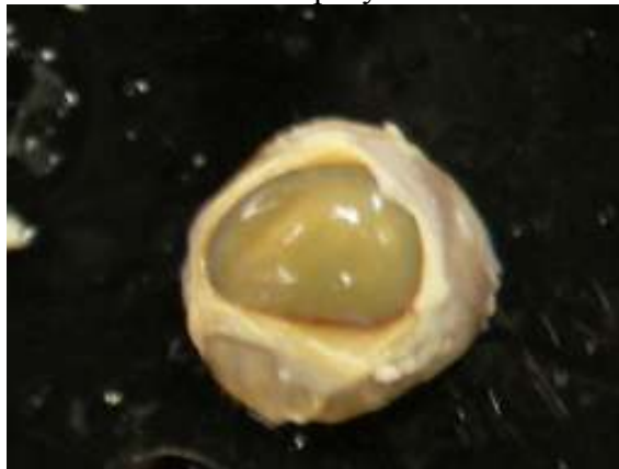
Cornea, conjunctiva and sclera