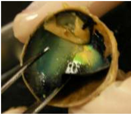
Choroid (thin pigmented layer