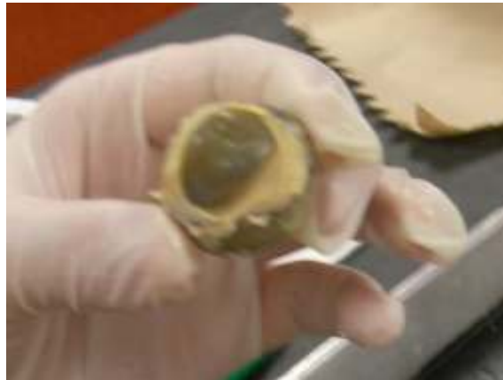
Trimmed Sheep Eye