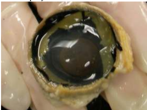
Vitreous Humor sac